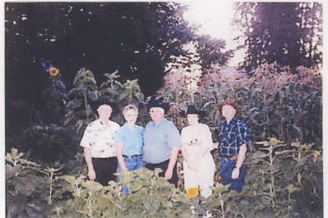
Crossroads Country Gospel Band Kalamazoo, Michigan