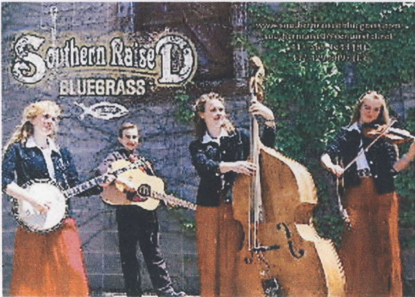
Southern Raised from Hurley, Missouri