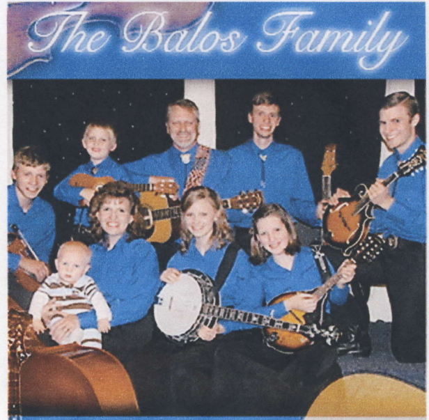
The Balos Family from Buchanan, Michigan